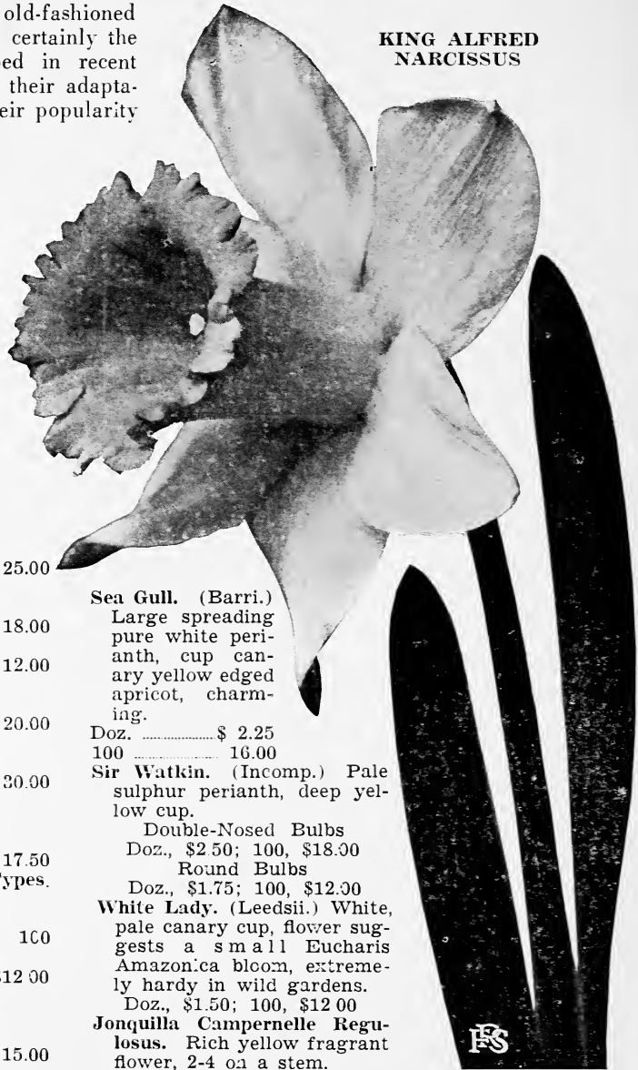
KING ALFRED NARCISSUS

Sea Gull. (Barri.) Large spreading pure white perianth, cup canary yellow edged apricot, charming.